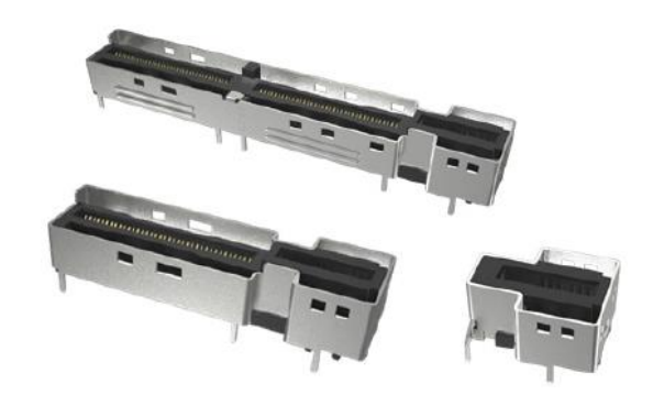
Multi-Trak REC Conn