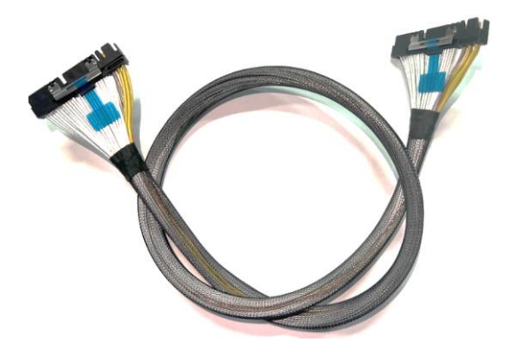
Multi -Trak Cable